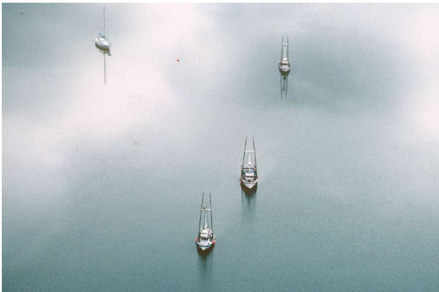
Fishing boats appear dream-like from above the fog. Fishermen and oyster farmers are concerned that a new state law will dissolve their industry.

CALENDAR > Tomales girls show art today at a women's town hall meeting in Point Reyes. /20