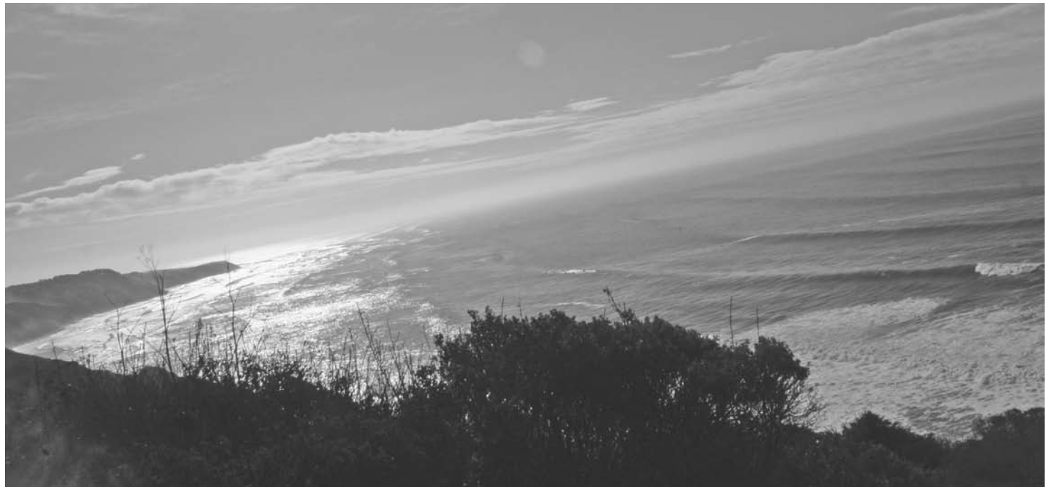
Stinson Beach is smack in the middle of the North Central coast MPA.

The are four groups involved in the process of creating the North Coast MPA, the Blue Ribbon Task Force, the Science Advisory Team, a group of 36 stakeholders and the MLPA initiative staff. The initiative staff set up MLPA meetings, prepare documents and organize the process. The Science Advisory Team advises the stakeholders on the biology and ecology of the areas being examined and the stakeholders come up with the proposals of just how to implement the MPAs. The Blue Ribbon Task Force assesses the proposals for socioeconomic and policy issues and chooses which to pass on to the